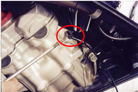
Pre 1998 CBR600

99 models: There is a grey vacuum pipe marked 'TA' cut into this pipe and insert the T-Piece from the Scottoil kit. Then press the Damper Elbow onto the third leg of the tee, as shown in the third picture.