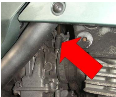
GPZ500 & KLE500

ER5 models: there is a pipe to the fuel tap, as shown in the third picture, cut into this pipe and insert the T-Piece from the Scottoil kit. Then press the Damper Elbow, part number 4, onto the third leg of the tee.