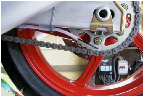
Note: Picture shows a similar Swingarm

The Dispenser Assembly, shown left, is routed along the underside of the Swingarm using Dispenser Mounting Sleeves, Cable Ties & Glue. Note: an epoxy resin (eg. Araldite) is req'd to bond the sleeves to the Swingarm.